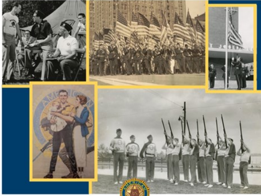
THE AMERICAN LEGION A BRIEF HISTORY